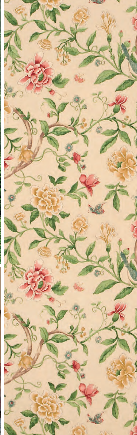
Sanderson Caverly Prints DCAVPO204