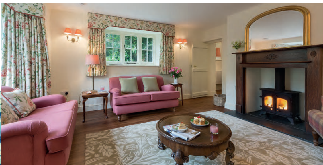
Sanderson Caverly Prints DCAVPO204