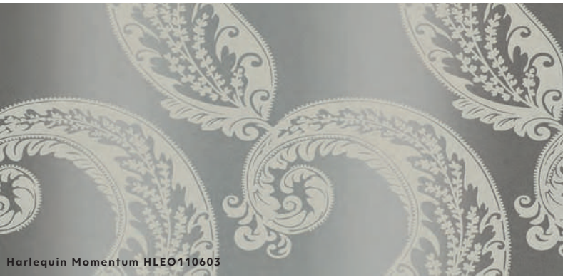
Harlequin Momentum HLE0110603

Lainston House is a charming 17th century country house situated in Winchester with a wealth of wonderful experiences to discover. Harlequin and Zoffany create this impressive luxurious interior.