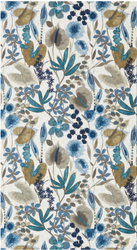
Harlequin Callista HAMA120333