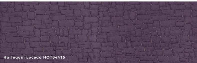
Harlequin Lucedo HOT04415