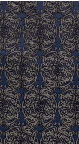
Harlequin Callista ZTES331265