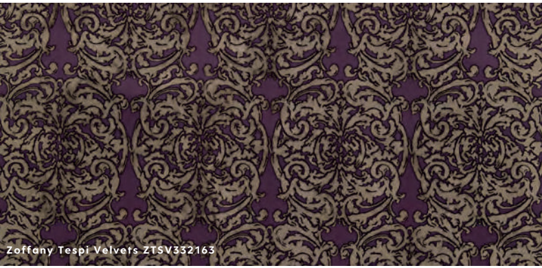
Zoffany Tespi Velvets Z1SV332163