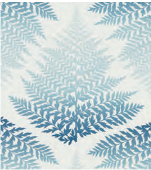
Harlequin Callista HCLS111379

South Lodge, a 19th century country house. Only 25 minutes away from Gatwick airport, the hotel is perfectly situated for a relaxing break in the countryside. Full of luxury and charm, there is an abundance of individually styled bedrooms, suites, and award-winning dining experiences.